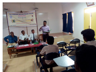
Placement interview conducted by Loyal Textile mills, Kovilpatti and Shri Govindaraja textiles, Aruppukottai