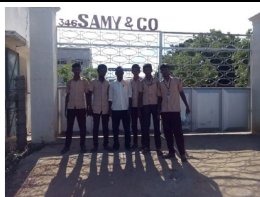
Industrial visits to M/s.Sudarsanam mills (Fabric division) and M/s.Samy & Co