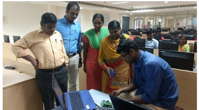
Faculty in the seminar @ Kongu Engg. College, Erode