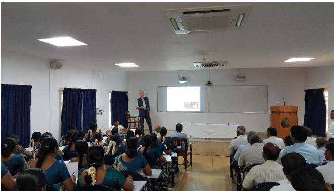
Workshop on "Solid Waste Management"