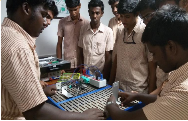
Value Added Course on "Sensorics"