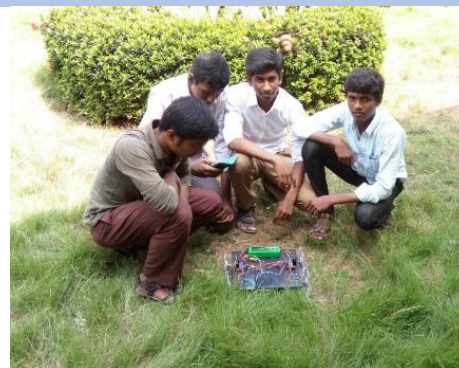
III Year students on Internship @ IIITDM