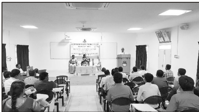
Our Principal delivers welcome address during the inaugural function