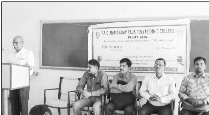
Our Principal and the resource persons are on the stage

In order to develop the communication skills of our students, a Personality Development Programme was conducted for III Year TEXTILE, EEE, ECE and MOP students by Mahindra Pride School, Chennai, from 23.04.18 to 28.04.18. A total of 144 students attended and were immensely benefitted out of this programme .