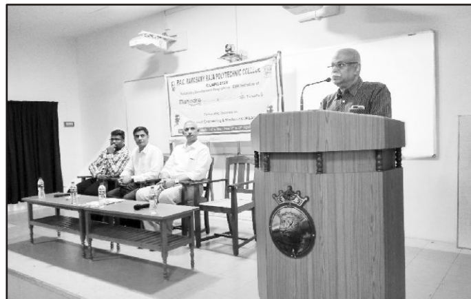
Our Principal addresses our students

A Personality Development Programme was conducted for III Year Mechanical Engineering students from 19.11.18 to 23.11.18 to hone the communication and aptitude skills of students by Mahindra Pride School, Chennai. A total number of 180 students were trained by the trainers from by Mahindra Pride School, Chennai.