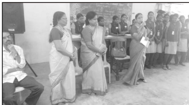
The Chief Guest addresses our students in the Mela.

"Vyapar Mela" was conducted on 20.09.18 in the Drawing Hall to develop entrepreneurial skill of the girl