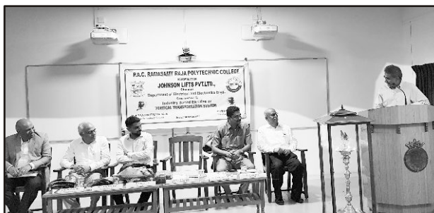
Our beloved Chairman addresses the audience