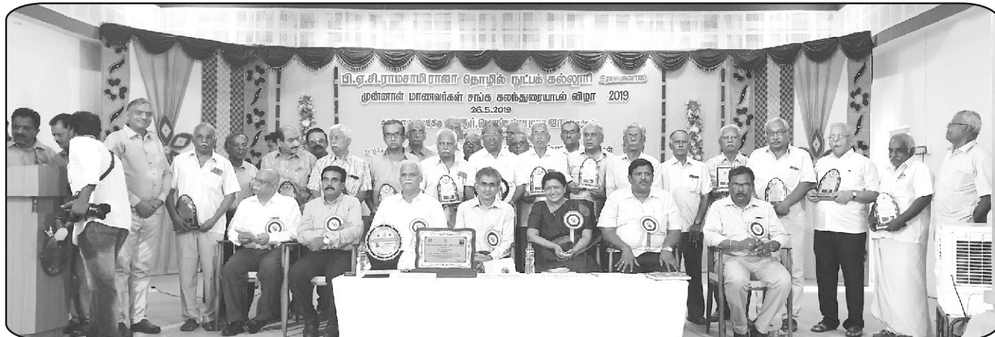
The achievers(Alumni) are with our Chief Guest, Chairman and Principal.