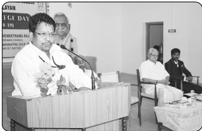
The Chief Guest addresses the audience