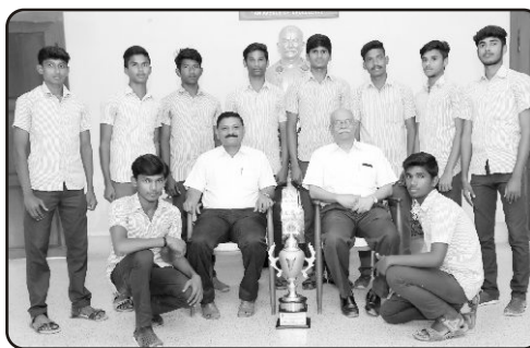
IPAA - State Level winners are with our Principal and Physical Director