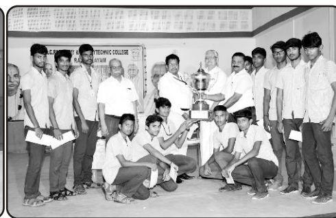
Winners receive the overall Championship Award