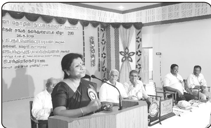
The Chief Guest addresses the audience