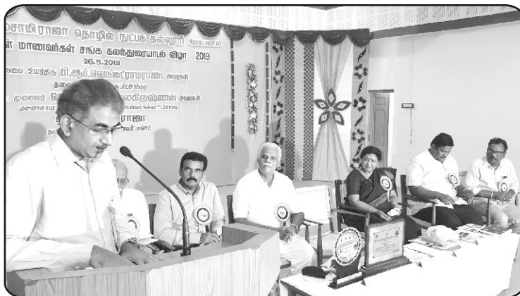
Our beloved Chairman addresses the audience